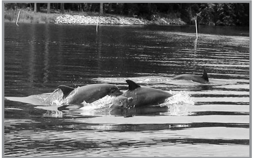
A large pod of dolphins visited the upper Great Wicomico River, off of Eagle Point and Glebe Point, just above the Route 200 bridge, in mid-August.

The secret to a healthy marsh is full sunlight. Marshes can be improved by pruning overhanging limbs and other vegetation so as to admit sunlight. A bit of fertilizer like 10-10-10 broadcast on