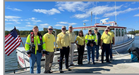
Smith Point Sea Rescue provides a safety boat and essential volunteers for NAPS Creek Cleanup events including the Oct. 2022 cleanup of Cockrells Creek (pictured) – always “there when needed”

NAPS has selected Smith Point Sea Rescue to receive the 2023 Northumberland Distinguished Citizen Award. The formal presentation will take place at the NAPS Annual Fall Social on Sunday, October 29 at the Tavern Meeting Building in Heathsville, VA, 4 p.m. to 7 p.m.