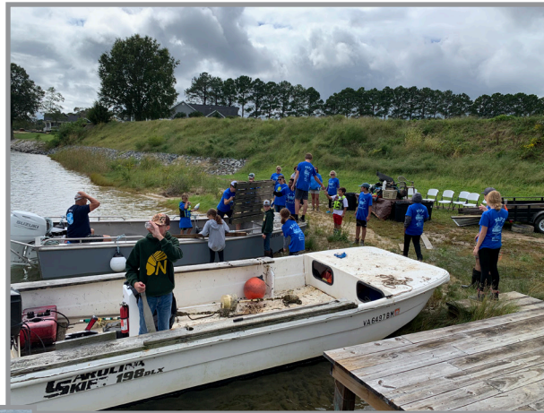
A few more photos from the 2023 NAPS Creek Cleanup , Sunday Sept. 24, Great Wicomico River - see brief article in the enclosed "NAPS News" and full article and slideshow soon at NAPSVa.org