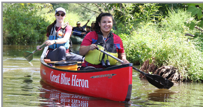
Students explore the lakes, ponds, and tidal rivers of eastern Virginia by canoe with the Virginia Rivers & Streams East Environmental Education Program

Students will probe the Bay's biologically diverse tidal waters to learn about the effects of waterside land uses and study the area's plants and wildlife.